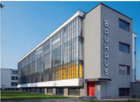
Dessau-Roßlau: Bauhaus Dessau

The route continues via historic Potsdam, surrounded by the River Havel and many lakes, through heath land and along picturesque country roads often lined with trees to Wittenberg , where Luther nailed up his theses on the door of the church and where there are many other locations associated with this great Reformer. Crossing the River Elbe, the route continues to Dessau-Roßlau , known for its association with the Bauhaus movement. As well as the Bauhaus itself, it is still possible to see the villas in which the Bauhaus Masters lived. The area is ideal for cyclists who can enjoy the Elbe cycle path and