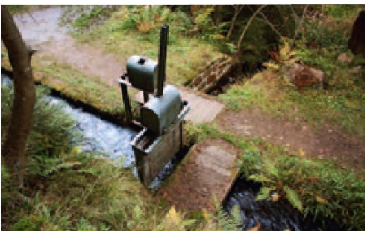
Goslar: Upper Harz Water Management System