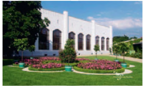
Weimar. Herzogin Anna Amalia Library