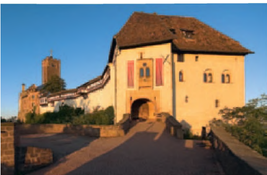
Eisenach: Wartburg Castle