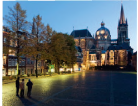
Aachen. The Cathedral