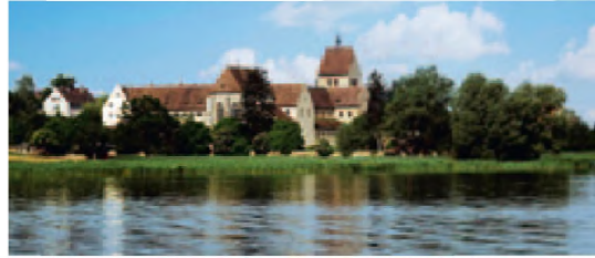
Island of Reichenau

This route begins in southern Bavaria by the Wieskirche ; the name is truly evocative of the 'Wiesen', the meadows, in which it stands on a slight elevation. There can be no more picturesque route than that which leads to Lake Constance: it runs along the Deutsche Alpenstrasse, the German Alpine Road, via Füssen, from which it is worth taking a detour to Neuschwanstein Castle. Then the road runs through the Allgäu and the Allgäu Alps to Lindau on Lake Constance and continues with fine views of the Lake to Meers-