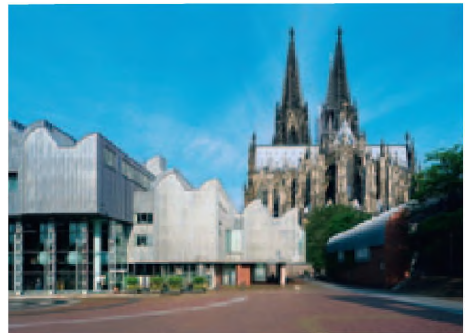
Cologne: The Cathedral