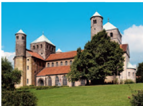
Hildesheim: St. Michael's Church

Historic Rammelsberg is known for more than 1000 years of mining history, and for a sophisticated water supply system, the Upper Harz Water Management System . From Goslar to Quedlinburg the route passes Wernigerode, which is a good place to embark on a hike in the Harz/Brocken National Park. Just outside Blankenburg, the former Cistercian abbey of Michaelstein is a favourite place to take a quiet break. The historic centre of Quedlinburg boasts 1300 half-timbered houses which originated over eight centuries. Over them presides the Romanesque Collegiate Church with the famous Ottonian treasure and the burial site of Heinrich und Mathilde. From here, the route continues through Thuringia, which is steeped in culture, past a host of castles and palaces to the mighty Wartburg , where visitors can experience over 900 years of German history and culture and where Luther laid the foundation for the German language with his translation of the Bible. The magnificent views of the Thuringia Forest are a rich reward for the climb up from the town of Eisenach.