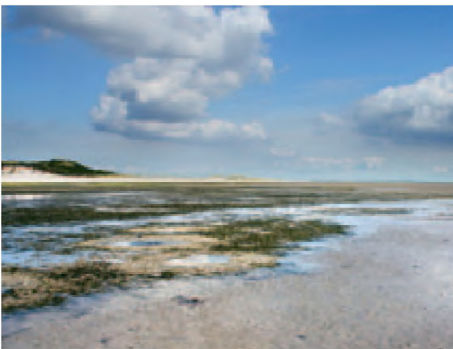
The Wadden Sea

heritage since 2004. Nearby is the monument to the world-famous Town Musicians of Bremen.