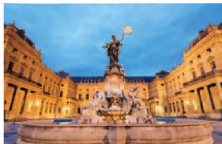
Würzburg: The Residency

550 kilometres. In many places along its length, such as Stockstadt and Aschaffenburg, parts of the Upper Germanic-Rhaetian Limes have been reconstructed in their original size and made accessible to the public in archaeological visitor centres.