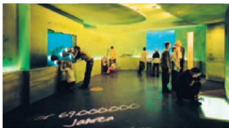
National Park Centre at Königsstuhl

ways and courtyards in the Old Town. The famous Lübeck marzipan tastes so delicious that the locals think it should be declared part of the World Heritage too!