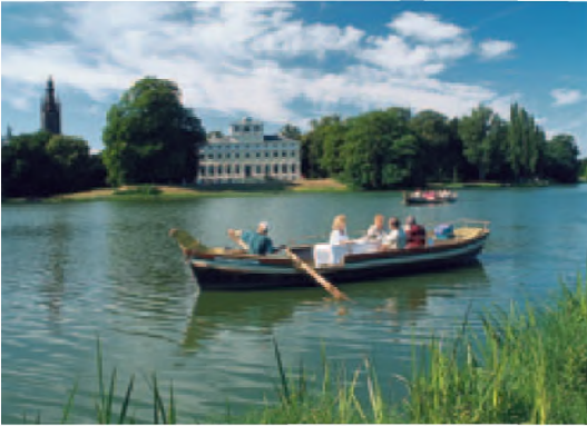
Garden Kingdom Dessau-Wörlitz