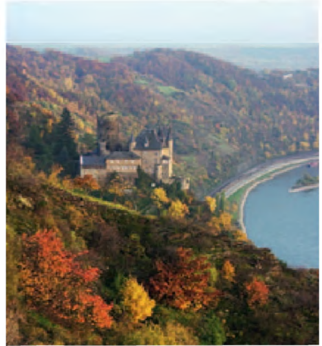
Upper Middle Rhine Valley

Already in itself a fabulously beautiful route along the River Rhine, the Upper Middle Rhine Valley World Heritage Site offers an exceptional abundance of cultural monuments. Starting in the traditional winery towns of Bingen and Rudesheim, the route follows the Rhine via Koblenz to Brühl , site of the rococo Castles of Augustusburg and Falkenlust with their wonderful gardens and grounds, where visitors can enjoy the architecture and the luxury of the 18th century in a perfectly and expertly preserved ensemble. Cologne lies approximately 15 kilometres away, it is the cultural centre of the region offering in addition to the famous cathedral a range of exceptional museums of international standing and a lively cultural scene. The next stop is Aachen , where the 1200-year-old cathedral awaits. Visitors will also enjoy a detour to the 'Dreiländereck', the 'Three Countries Corner', which straddles the borders of Germany, Belgium and Holland. The route continues through the mining heartland of the Ruhr valley to the final stop in Essen , where a visit to the original Zollverein colliery and coking plant provides memorable insight into a piece of industrial history.