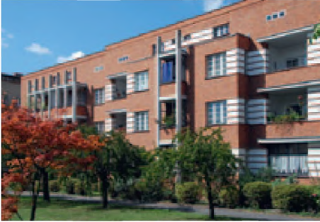
Berlin: Modernism Housing Estates

Berlin's Modernism Housing Estates were among the first examples of social housing in Germany. They are the work of renowned architects, most notably Bruno Taut, who was responsible for the Schillerpark Estate and the Falkenberg Garden City.