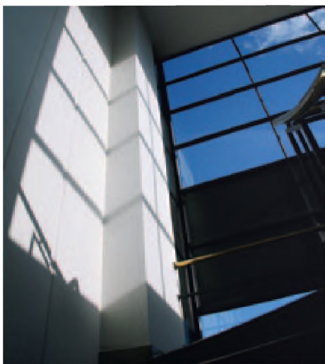
Alfeld: The Fagus Factory

Hildesheim is a cultural centre between the Harz and Hannover. It is at the heart of the Leinebergland region, which is popular with holidaymakers who like to enjoy both hiking and culture.